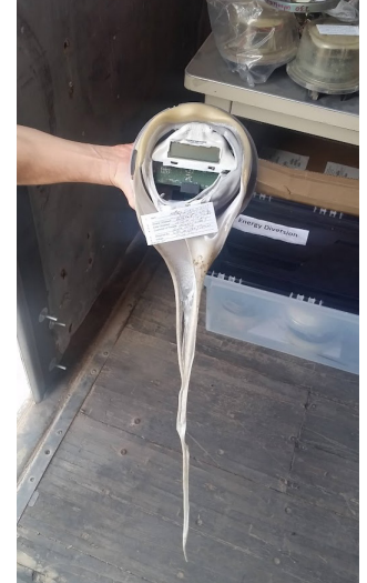
Effect of high-temperature meter conditions